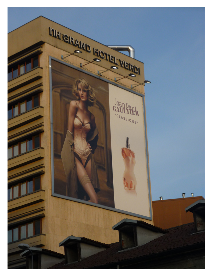
Figure 2. Jean-Paul Gaultier 2011 advertising campaign for the Gaultier perfume brand "Classique", first introduced in 1993, which directly refers to the concept of "classic" or "eternal" (good) taste comparable to a perfect body shape which stays rather constant.

insufficient or non-existing exchange of information about the objects of desire, for instance, fashion items (Figure 3).