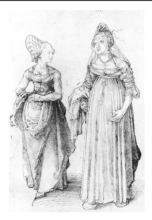
Figure 3. Illustration of desynchronization of fashion styles in former times: The picture shows a drawing by Albrecht Dürer from 1496–1497 depicting a typical style of a bourgeois from Nuremberg (left) and from Venice (right) emphasising long legs by the usage of high chopines plus a skirt cut with the waist edge just beneath the female bust.

Beside the mechanism of adaptation being a plausible source of synchronization of aesthetic appreciation, we essentially need a further ingredient for explaining the sources of the changes of artistic style (Augustin et al 2008) or the "Formensprache" (Carbon 2010). Actually, we need a clue for the cognitive principle which triggers innovation itself. Artists and designers belonging to the creative sector evidently have to innovate, or else they will only copy previous work and just prefer (and thus create) what they have already generated due to mere exposure or other familiarity phenomena (Martindale et al 1988). Martindale (1990) solves the problem by assuming inherent conservatism on the side of typical beholders (see Carbon and Leder 2005), but high innovative power and flexible taste on the side of the artists (Martindale 1994). Such trendsetters can start a period of synchronization with a more conservative audience just as illustrated by Figure 5. What are probable candidates for the compulsion of creating and innovating things? First, people often get bored by too familiar exemplars after a while, a phenomenon ascribed in the 19th century by Göller (1888), which he termed "Formermüdung" (form fatigue); second, creative people compete with each other, creating ongoing innovations; third, partly nonconscious, adaptation to innovative and distinctive parts from other cultures, domains, or exemplars re-shaping the creative one's visual habits themselves.