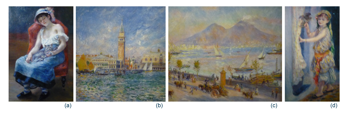
Figure 1. Paintings by Pierre-Auguste Renoir (1841–1919) from a narrow period of time of his artistry show a high consistency of the specific usage of the colour blue. From left to right: (a) Sleeping Girl (1880), (b) Venezia, the Doge's Palace (1881), (c) Bay of Naples, Evening (1881), (d) Child with a Bird (1882).

artistic styles evolved, how they inspired each other, and how they replace out-dated ones. Notwithstanding, art history mainly tries to explain how and sometimes why certain artistic streams emerged, but not whether and why beholders appreciate the objects generated from these streams.