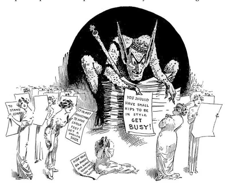
Figure 7. Image is from the Wikimedia Commons, originally from Life magazine from 1913 describing fashion as an evil force which explicitly dictates fashion rules that people have to follow.

"Geschmacksapparat" (system for validly assessing our taste) incidentally, without explicit reference. In contrast to Figure 7, which portrays the view of an almighty entity explicitly dictating fashion rules that people have to follow, we seem to be biased much more indirectly, nonconsciously by such a mechanism.