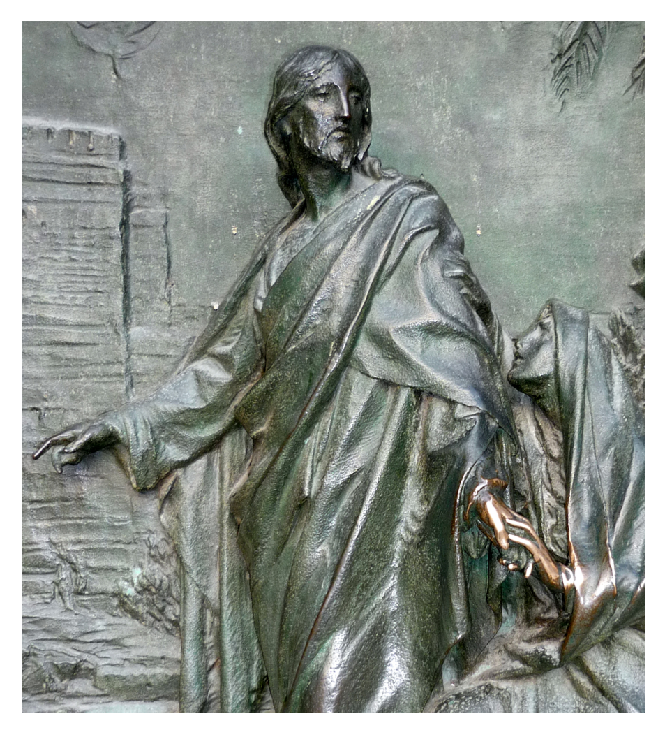
Figure 4. Detail of the bronze gates of the Duomo di Milano (Milan cathedral; lower part of the Major Door, planned by L Pogliaghi) demonstrating frequent touching of specific parts of the holy scenes, which results in burnishing these parts over the years. The highly selective burnishing indicates synchronized visitors' behaviour, here the touching of the central and significant mutual soft touch of Jesus' and Maria's hands.