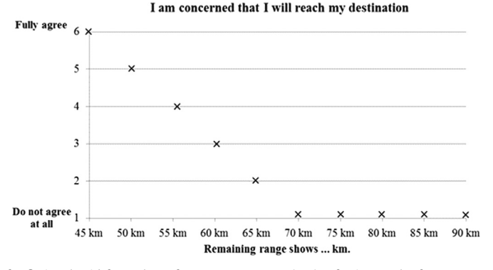
Fig. 2. An example of a fictional grid from the Safe-Range-Inventory (SRI) referring to the facet concerns about reaching the destination . Participants simply had to tick their assessment for each remaining range (at the start of their trip).